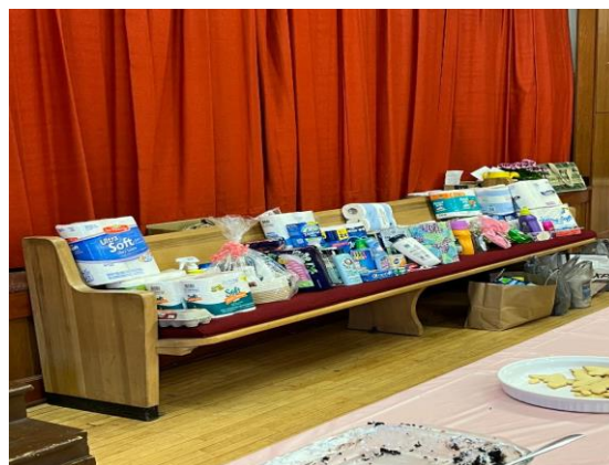
So many donations, thank you everyone.