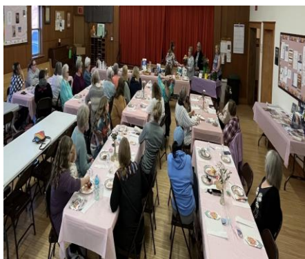
Look at all who enjoyed a great dinner. Fun was had by all.